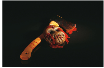
Bloody Jason's Mask

Approximately 200 Halloween goods will be released for a limited period only. A wide array of highly cute items featuring characters in adorable Halloween costumes will be offered at Park shops. Meanwhile, the whistle (¥700) is the most recommended, and a must item for Parade de Carnivale. This item will help you boost the festive mood of the parade. In addition, other one-of-a-kind goods that you can obtain only at Universal Studios Japan, such as items featuring Snoopy in mummy costumes, will boost the exciting Halloween atmosphere.