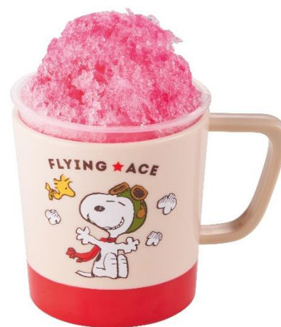
Snoopy Mug Cup Available for purchase at Snoopy's™ Backlot Café